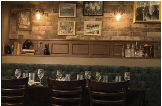
Canterbury Park's Little Chicago

The GTO life play at The Venetian is 100% The Dorsey. Stop in early and try their signature drink "The Penicillin," identified by The New York Times as one of the eleven essential drinks of the modern cocktail revival. Stop by later in the night and experience live curated music by renowned DJs who spin old school classics as well as newer tunes that fit the vibe.