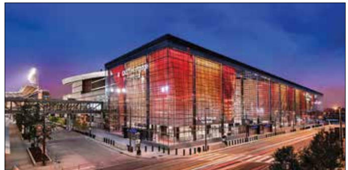
Rocket Mortgage FieldHouse