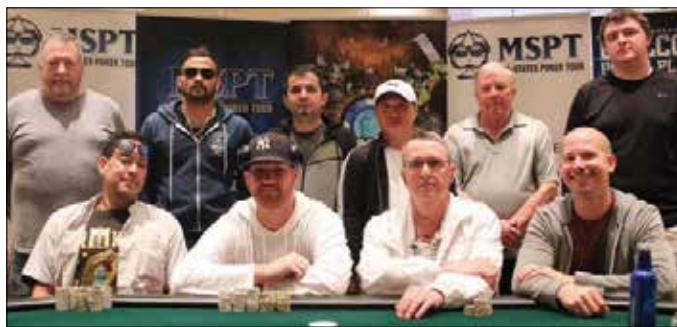
$350 Main Event Final Table